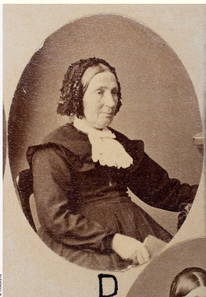
1872-1881 from "Group of [women] Old Colonists "