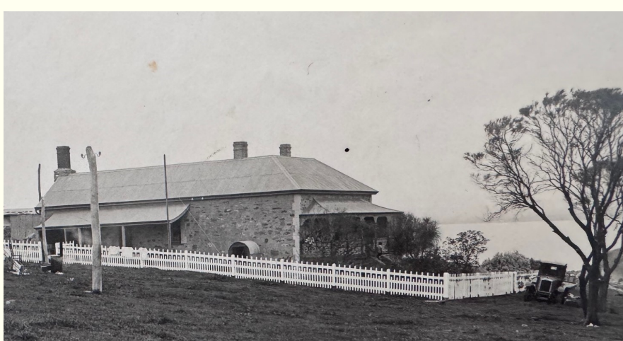
Torr House YDHS 11937