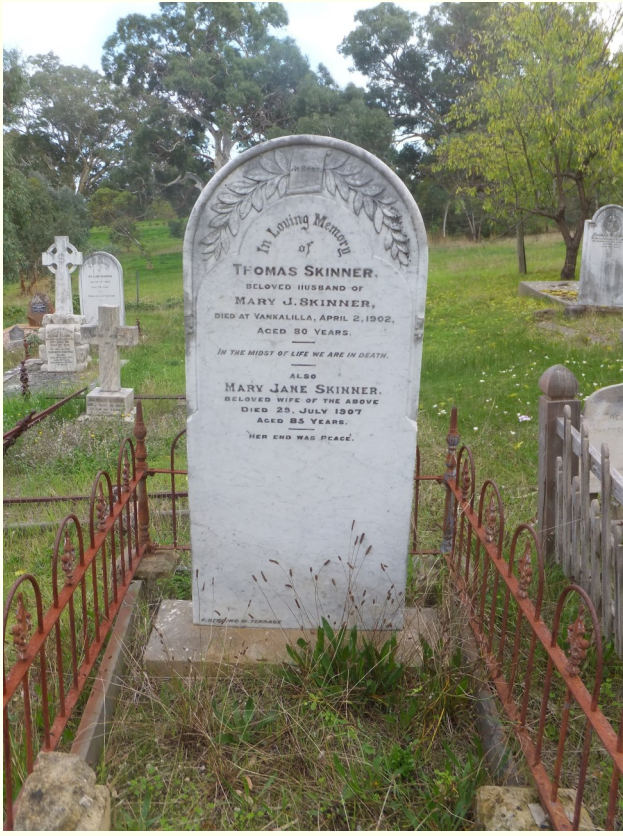
Skinner headstone Christ Church cemetery