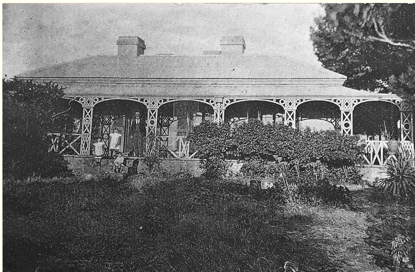
Cape Jervis Station 1904