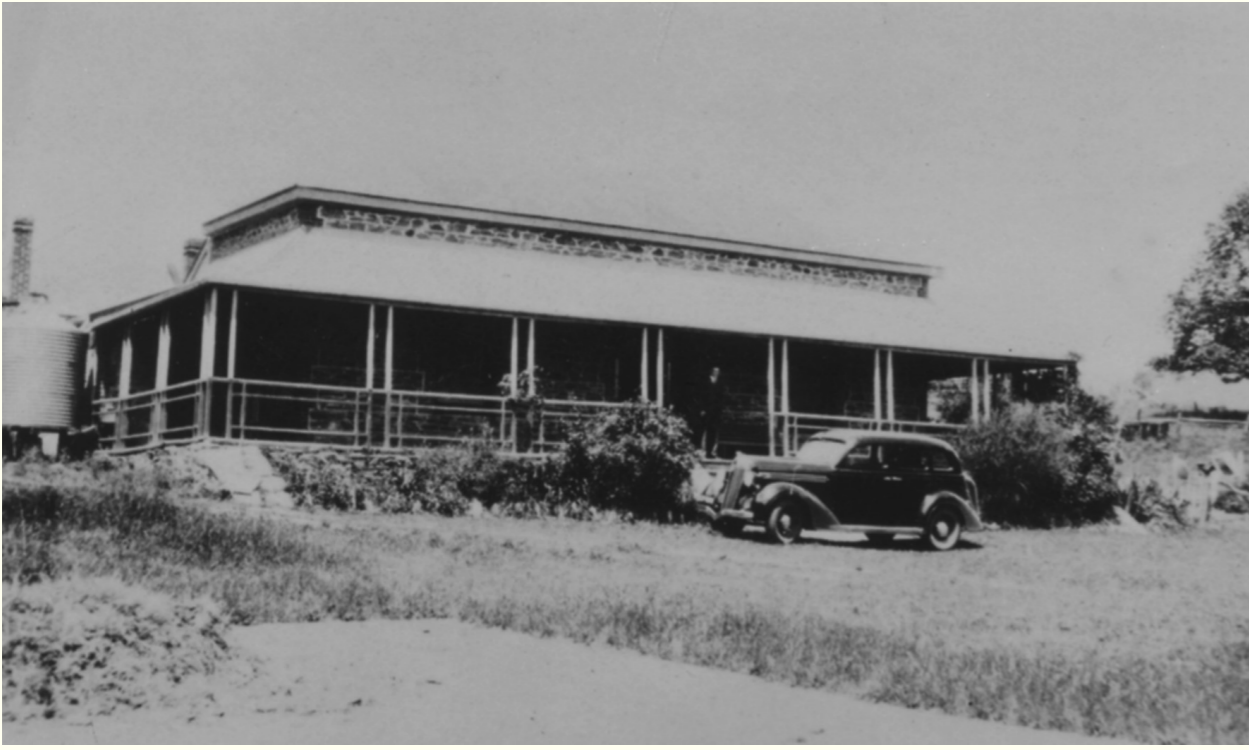
Alton Grange c 1940s