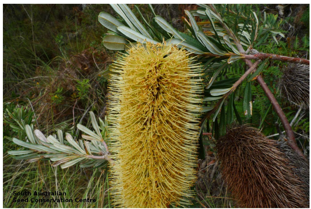
Photograph of the flowerhead of Banksia marginata , (otherwise known as Silver Banksia )