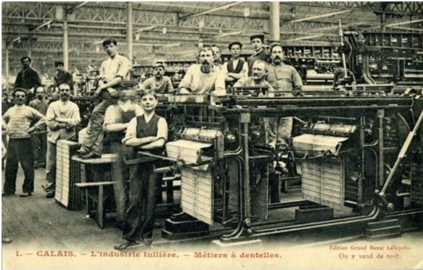
Calais Lacemaking machine

https://www.cite-dentelle.fr/en/detail/566ef6601a6c7e8b078b456d/the-origins-of-lace-in-calais-