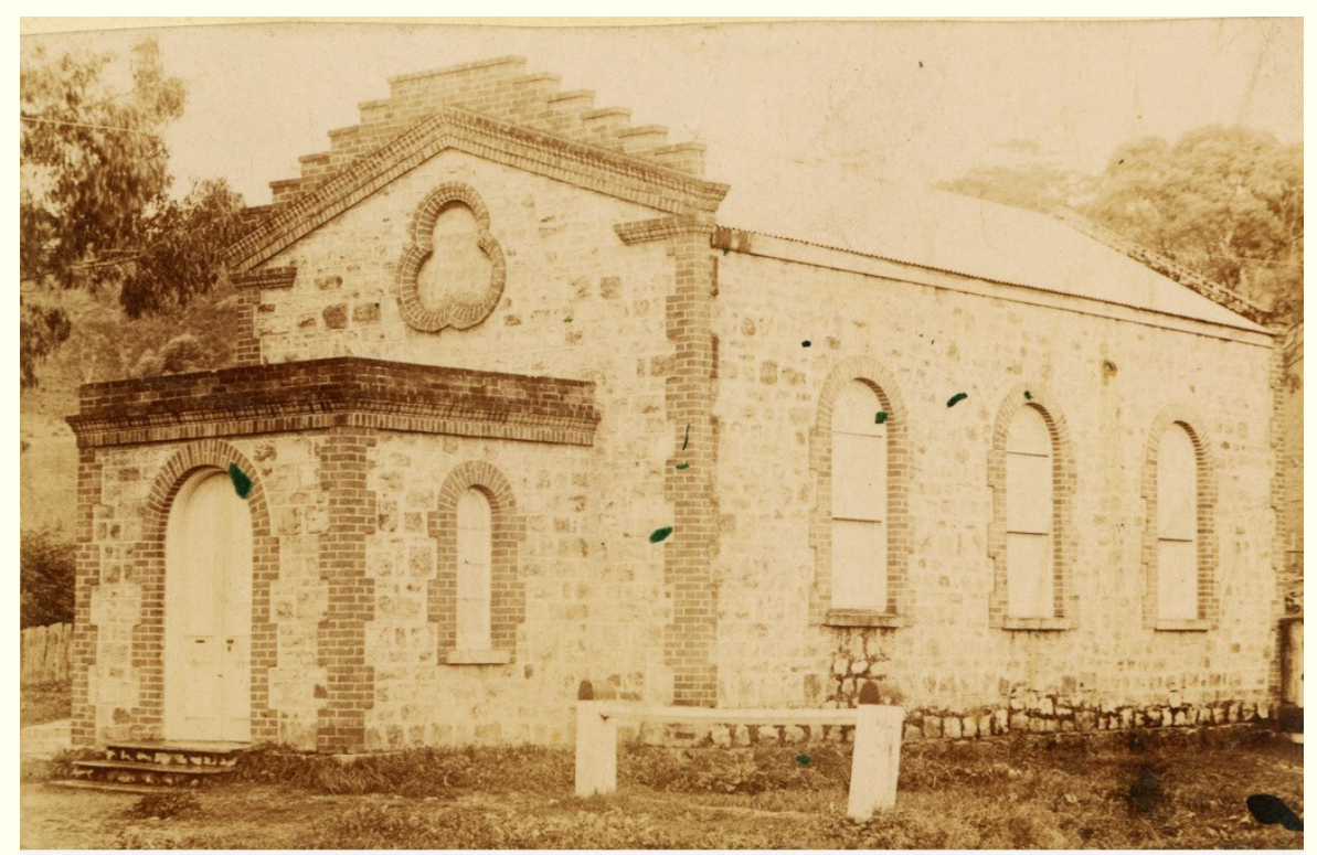
Yankalilla Council Chambers c.1870.