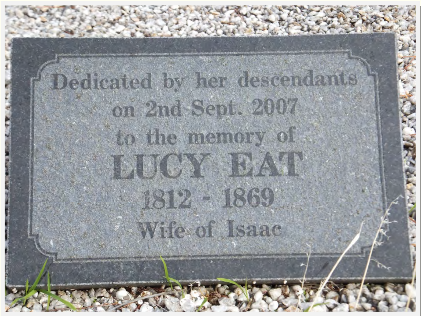
Memorial plaque Yankalilla cemetery