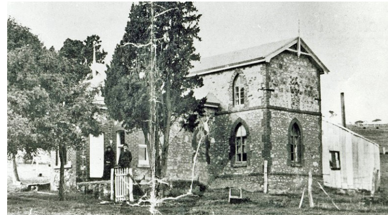
SLSA B27912 Chapel circa 1925

This reserve was established by the Rotary Club of Yankalilla in 1988.